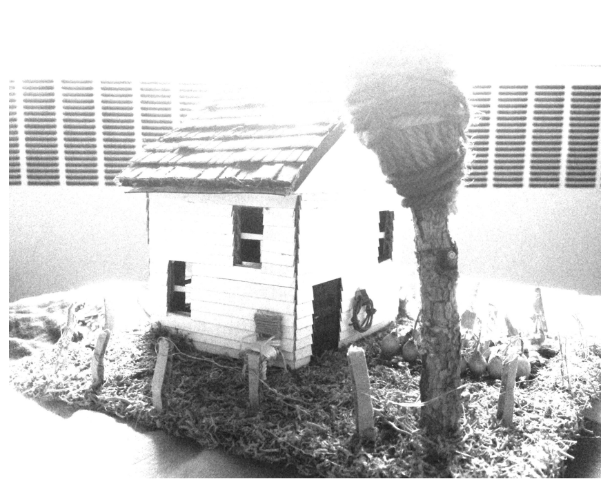
2. Back right corner