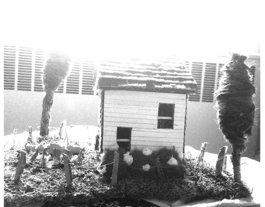
4. Left side view