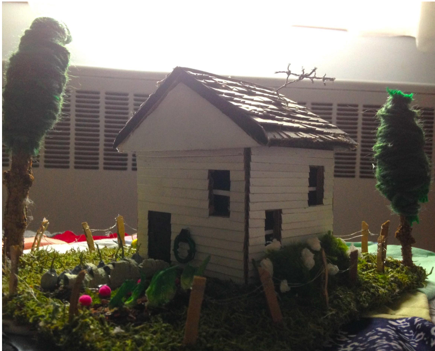
3. Back w/ garden