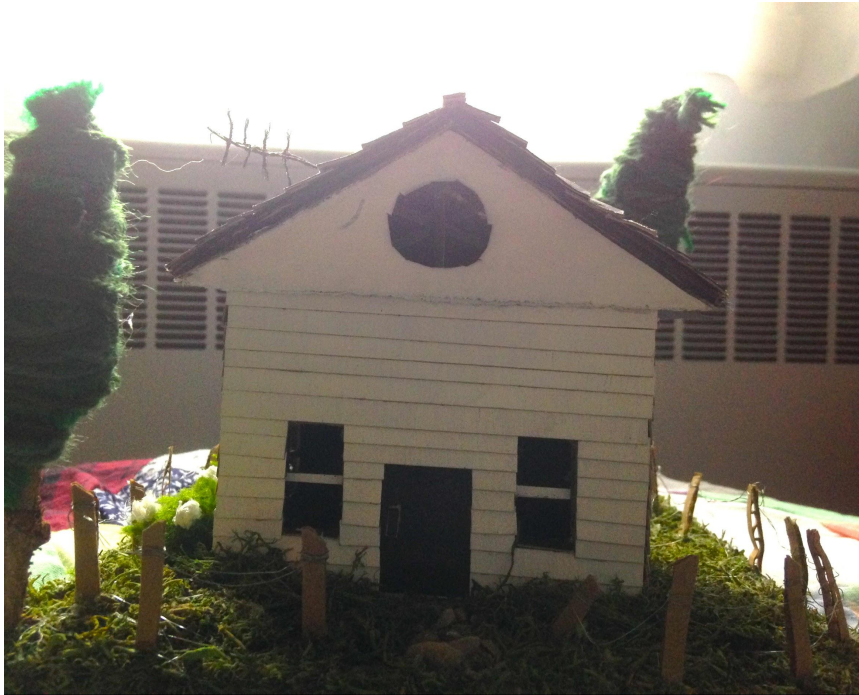
1. Reconstruction - Front